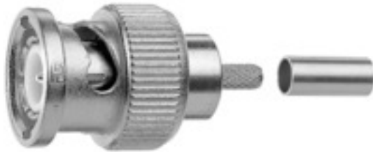
Fig. may differ

BNC Straight Plug Crimp G2 (RG-59 B/U) crimp/crimp Standard